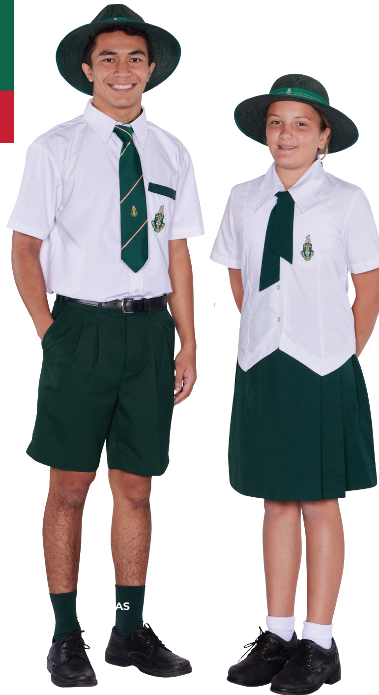
YEAR 7 - 9