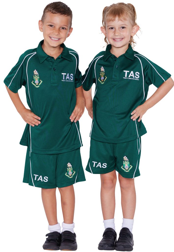
KINDY - YEAR 2

Please note: Some tweaking and finessing of the new uniform items may still occur.