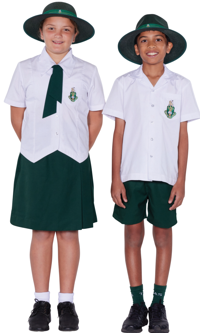
YEAR 3 - 6