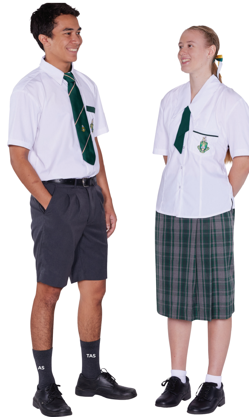
YEAR 10 - 12